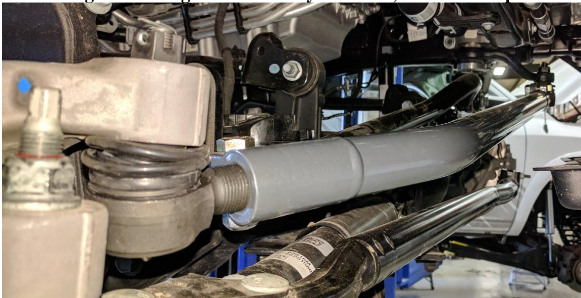
Figure 8. Drag Link Correctly Oriented, Pinch Bolt Back, Bend Forward