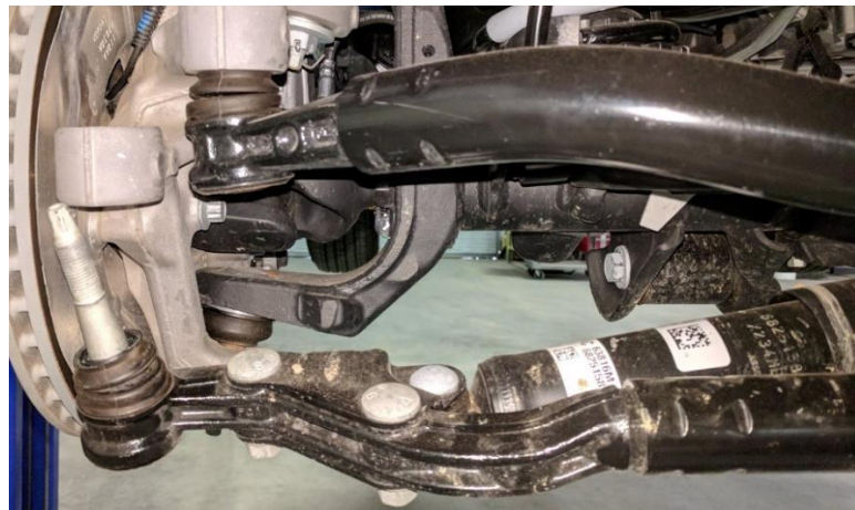
Figure 2. Tie Rod Removed From Knuckle