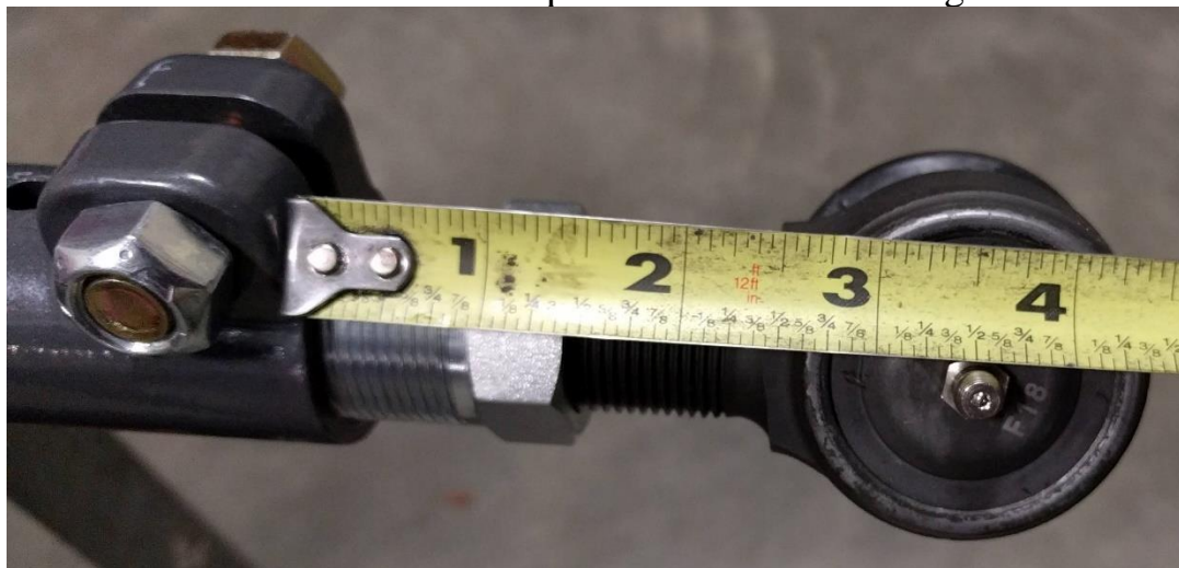
Figure 6. Maximum Length on Double Adjuster (Pitman Arm) Side

14. Attach the straight end (with double adjuster) of the drag link to the pitman arm with a castle nut. Leave the castle nut hand tight. Swing the bent end of the drag link over towards the steering knuckle and observe the length change required to get the tie rod end to install in the hole in the knuckle. Adjust the drag link length with the adjuster sleeve at the pitman arm side as needed to get the tie rod end to drop into the hole on the knuckle. Make sure the adjuster sleeve end is adjusted by turning the adjuster sleeve and not the tie rod end. The amount of thread of the adjuster sleeve and tie rod end showing should be the same. DO NOT THREAD THE DOUBLE ADJUSTER TIE ROD END OUT FARTHER THAN THE 3.5" SHOWN IN FIGURE 6. If the adjuster is all the way out and the steering still does not line up, turn the adjuster back in a few turns. Remove the knuckle side tie rod end from the knuckle and thread it out of the drag link farther until the wheel is aligned. We recommend rotating the sleeve until one of the slots in the sleeve lines up with the slot in the drag link.