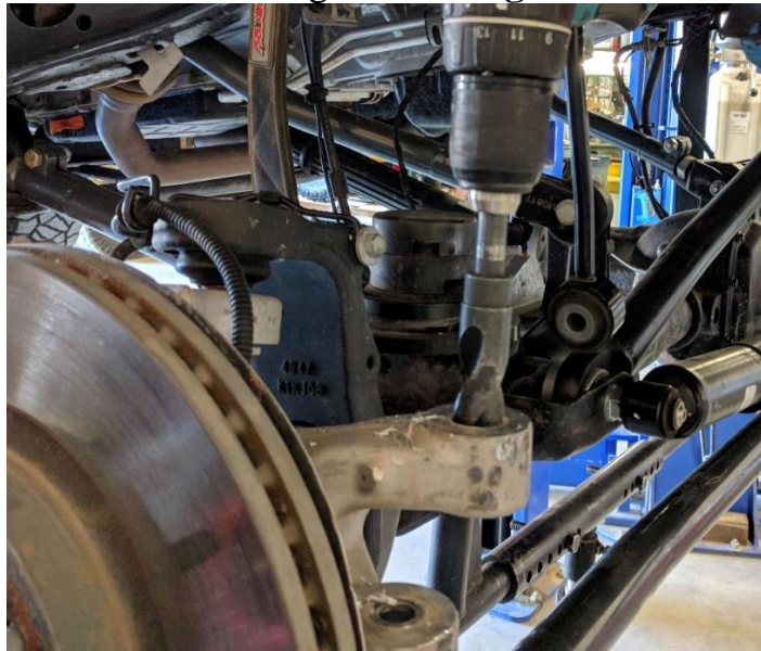
Figure 3. Drilling out Steering Knuckle