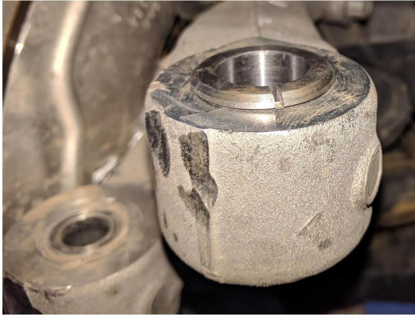
Figure 4. Flip Adapter in Steering Knuckle