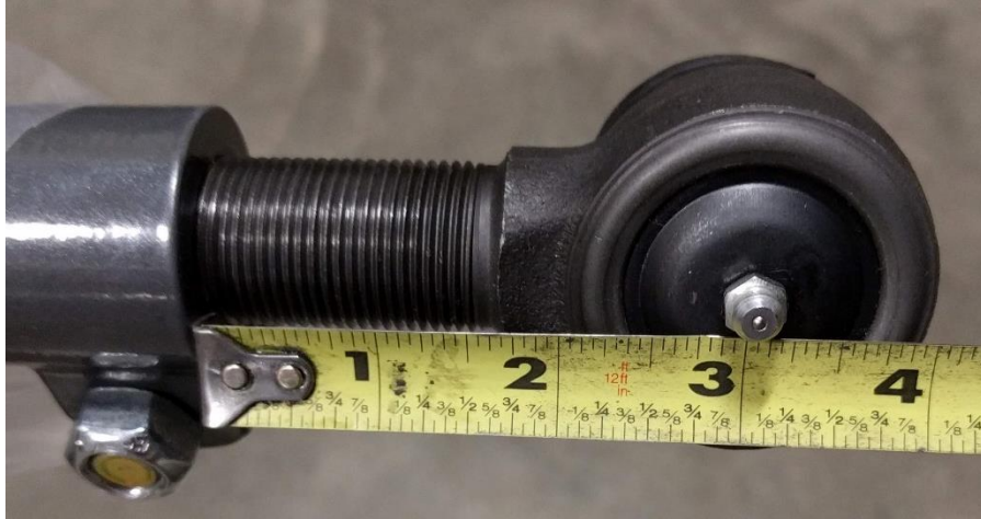
Figure 5. Maximum Length on Non-Double Adjuster (Knuckle) Side

14. Attach the straight end (with double adjuster) of the drag link to the pitman arm with a castle nut. Leave the castle nut hand tight. Swing the bent end of the drag link over towards the steering knuckle and observe the length change required to get the tie rod end to install in the hole in the knuckle. Adjust the drag link length with the adjuster sleeve at the pitman arm side as needed to get the tie rod end to drop into the hole on the knuckle. Make sure the adjuster sleeve end is adjusted by turning the adjuster sleeve and not the tie rod end. The amount of thread of the adjuster sleeve and tie rod end showing should be the same. DO NOT THREAD THE DOUBLE ADJUSTER TIE ROD END OUT FARTHER THAN THE 3.5" SHOWN IN FIGURE 6. If the adjuster is all the way out and the steering still does not line up, turn the adjuster back in a few turns. Remove the knuckle side tie rod end from the knuckle and thread it out of the drag link farther until the wheel is aligned. We recommend rotating the sleeve until one of the slots in the sleeve lines up with the slot in the drag link.