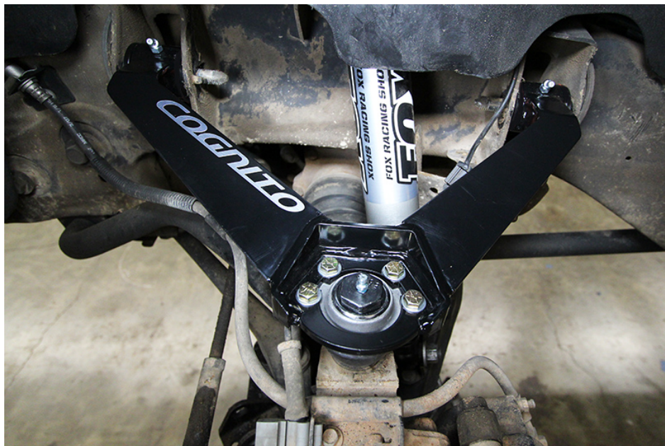
Figure 4: Passenger side Cognito control arm installed