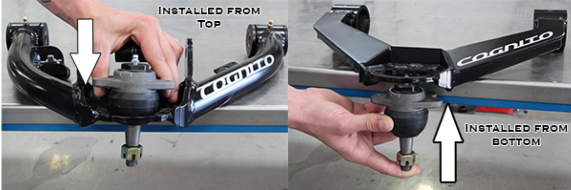
Figure 2: ball joint installation