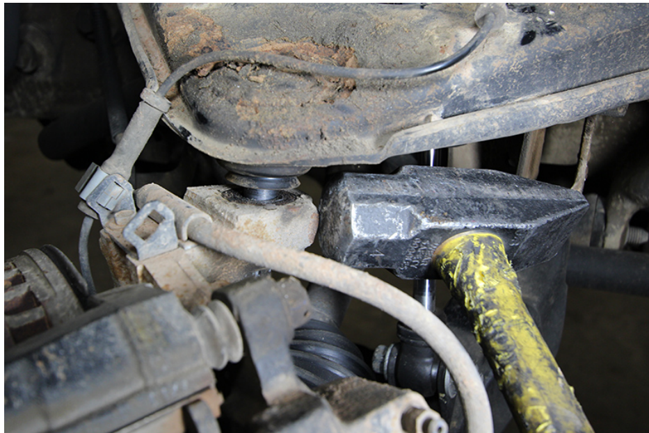
Figure 1: breaking ball joint loose from spindle