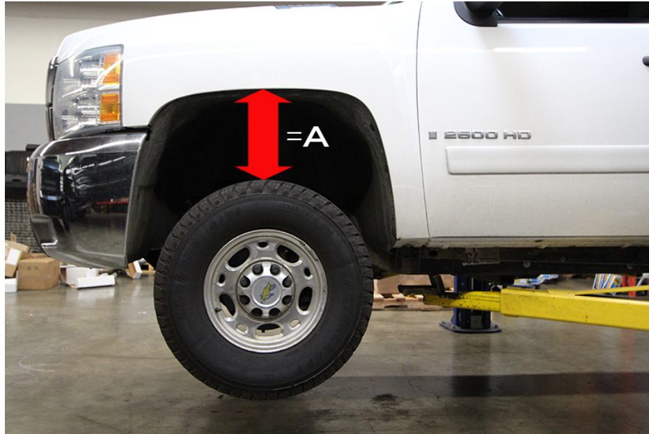
Figure 5: Distance between top of tire and fender lip.